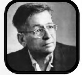
EDGAR PANGBORN (GHOST OF HONOR)

An American writer of mystery, historical, and science fiction, Edgar Pangborn was the son of a supernatural fiction writer and a dictionary editor. Leaving his Harvard musical studies incomplete, he shifted to a career in fiction. Initially he wrote pulp detective and mystery stories under a pseudonym as he developed his craft, then shifted in the 1950's to science fiction and mystery writing in a humanist style that would inspire the next generation of writers such as Peter S. Beagle and Ursula K. Le Guin.