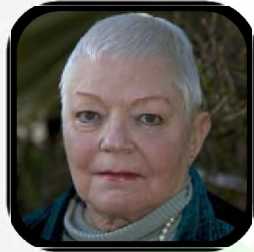
CHELSEA QUINN YARBRO

Two life-changing things happened to Chelsea Quinn Yarbro in 1968: she attended her first WorldCon and she sold her first story. Since then, she has attended many more conventions and published 81 works of short fiction in multiple genres and is presently working on her 95th sold book.